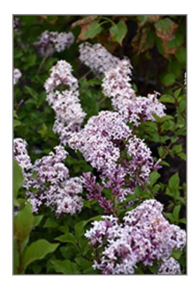
Cheyenne Korean Early Lilac flowers

This is a relatively low maintenance shrub, and should only be pruned after flowering to avoid removing any of the current season's flowers. It is a good choice for attracting butterflies to your yard. It has no significant negative characteristics.