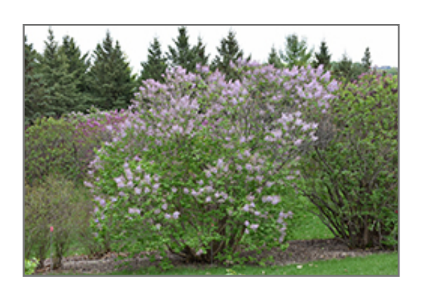
Cheyenne Korean Early Lilac in bloom

Cheyenne Korean Early Lilac is recommended for the following landscape applications;