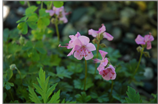
Claridge Druce Cranesbill flowers

Claridge Druce Cranesbill is recommended for the following landscape applications;