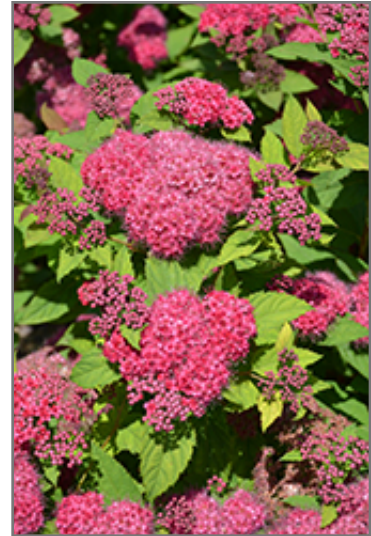
Double Play Red Spirea flowers

This shrub will require occasional maintenance and upkeep, and is best pruned in late winter once the threat of extreme cold has passed. It is a good choice for attracting butterflies to your yard, but is not particularly attractive to deer who tend to leave it alone in favor of tastier treats. It has no significant negative characteristics.