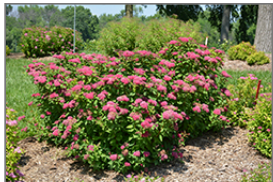
Double Play Red Spirea in bloom