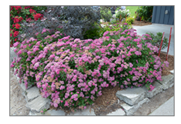
Double Play Pink Spirea in bloom

This variety features dark burgundy emerging foliage that transitions to a rich green; clusters of pink blooms in late spring and summer; has a dense mounded habit perfect for landscapes