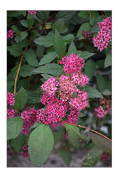
Double Play Pink Spirea flowers

Double Play Pink Spirea is recommended for the following landscape applications;