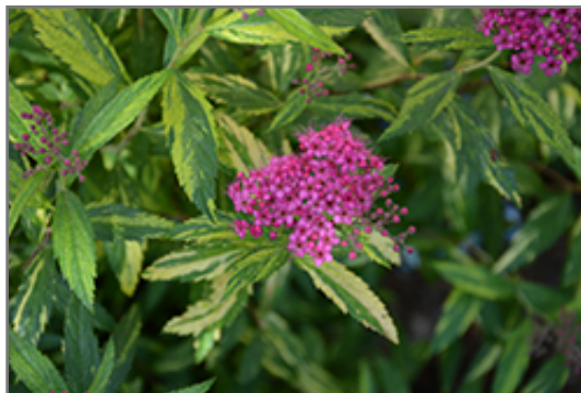
Double Play Painted Lady Spirea flowers

Double Play Painted Lady Spirea is recommended for the following landscape applications;