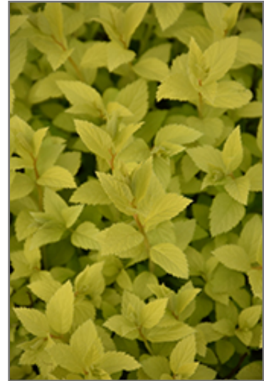
Double Play Gold Spirea foliage

This shrub should only be grown in full sunlight. It prefers to grow in average to moist conditions, and shouldn't be allowed to dry out. It is not particular as to soil type or pH. It is highly tolerant of urban pollution and will even thrive in inner city environments. This is a selected variety of a species not originally from North America.