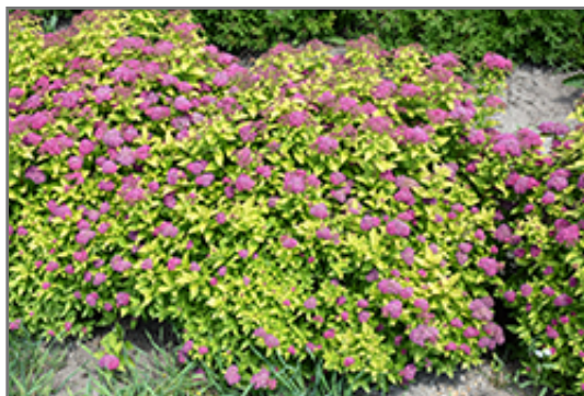
Double Play Gold Spirea in bloom