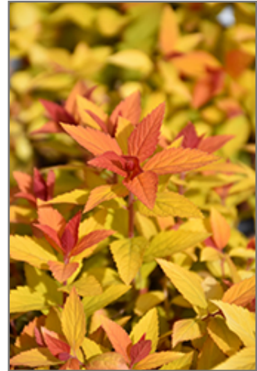
Double Play Candy Corn Spirea foliage

Double Play Candy Corn Spirea is recommended for the following landscape applications;