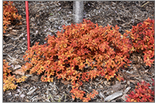
Double Play Candy Corn Spirea

This shrub should only be grown in full sunlight. It prefers to grow in average to moist conditions, and shouldn't be allowed to dry out. It is not particular as to soil type or pH. It is highly tolerant of urban pollution and will even thrive in inner city environments. This is a selected variety of a species not originally from North America.