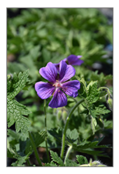
Showy Cranesbill flowers

This is a relatively low maintenance plant, and should only be pruned after flowering to avoid removing any of the current season's flowers. It is a good choice for attracting butterflies to your yard, but is not particularly attractive to deer who tend to leave it alone in favor of tastier treats. It has no significant negative characteristics.