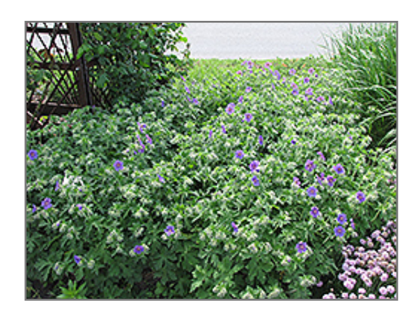
Showy Cranesbill in bloom

Showy Cranesbill will grow to be about 18 inches tall at maturity, with a spread of 24 inches. When grown in masses or used as a bedding plant, individual plants should be spaced approximately 20 inches apart. Its foliage tends to remain dense right to the ground, not requiring facer plants in front. It grows at a medium rate, and under ideal conditions can be expected to live for approximately 10 years. As an herbaceous perennial, this plant will usually die back to the crown each winter, and will regrow from the base each spring. Be careful not to disturb the crown in late winter when it may not be readily seen!