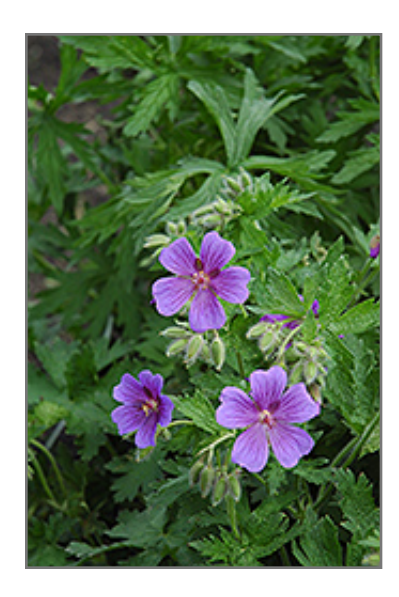
Showy Cranesbill flowers