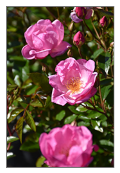
Thrive! Lavender Rose flowers

An attractive shrub rose, featuring semi-double lavender to pink flowers in early summer; bushy, upright habit, hardy and resistant to disease, ideal as a low flowering hedge; all roses need full sun and well-drained soil