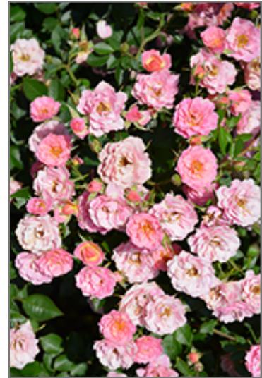
Oso Easy Petit Pink flowers