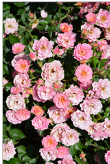
Oso Easy Petit Pink flowers