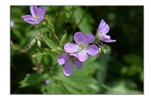
Spotted Cranesbill flowers