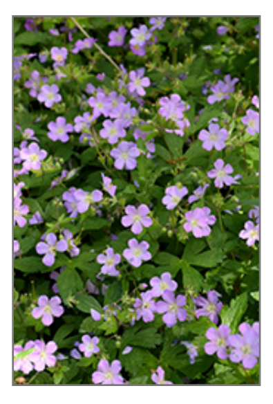
Spotted Cranesbill flowers

This plant will require occasional maintenance and upkeep, and should only be pruned after flowering to avoid removing any of the current season's flowers. Deer don't particularly care for this plant and will usually leave it alone in favor of tastier treats. Gardeners should be aware of the following characteristic(s) that may warrant special consideration;