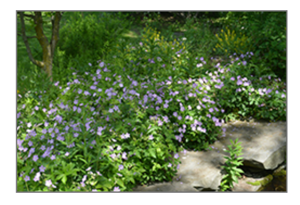
Spotted Cranesbill in bloom

Spotted Cranesbill will grow to be about 24 inches tall at maturity, with a spread of 24 inches. When grown in masses or used as a bedding plant, individual plants should be spaced approximately 20 inches apart. Its foliage tends to remain dense right to the ground, not requiring facer plants in front. It grows at a medium rate, and under ideal conditions can be expected to live for approximately 10 years. As an herbaceous perennial, this plant will usually die back to the crown each winter, and will regrow from the base each spring. Be careful not to disturb the crown in late winter when it may not be readily seen!