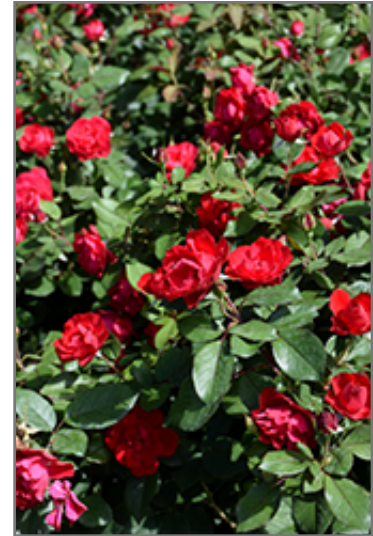
Oso Easy Double Red Rose flowers

This shrub should only be grown in full sunlight. It does best in average to evenly moist conditions, but will not tolerate standing water. It is not particular as to soil type or pH. It is somewhat tolerant of urban pollution. This particular variety is an interspecific hybrid.