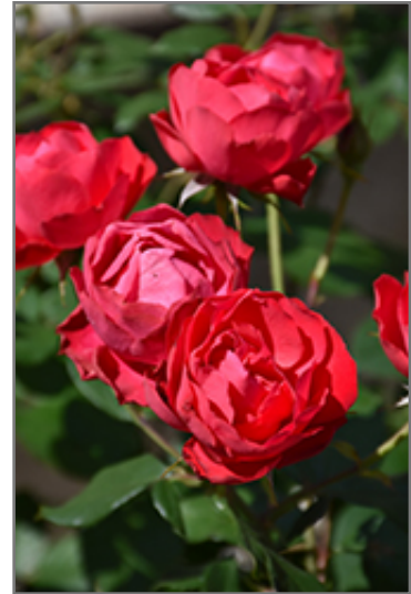
Oso Easy Double Red Rose flowers

Oso Easy Double Red Rose is recommended for the following landscape applications;