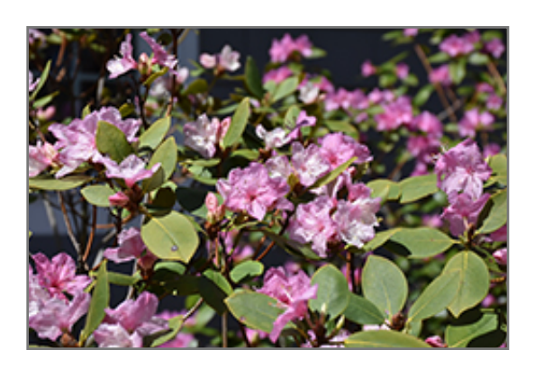
Weston's Crescendo Rhododendron flowers

A beautiful broadleaf evergreen shrub featuring pink flowers in spring and a dense, compact habit, very hardy; absolutely must have well-drained, highly acidic and organic soil, use plenty of peat moss when planting