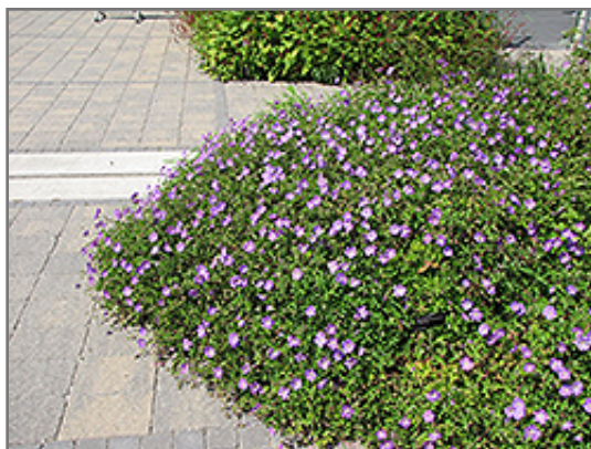
Rozanne Cranesbill in bloom

Rozanne Cranesbill is a fine choice for the garden, but it is also a good selection for planting in outdoor containers and hanging baskets. It is often used as a 'filler' in the 'spiller-thriller-filler' container combination, providing a mass of flowers against which the thriller plants stand out. Note that when growing plants in outdoor containers and baskets, they may require more frequent waterings than they would in the yard or garden. Be aware that in our climate, most plants cannot be expected to survive the winter if left in containers outdoors, and this plant is no exception. Contact our experts for more information on how to protect it over the winter months.