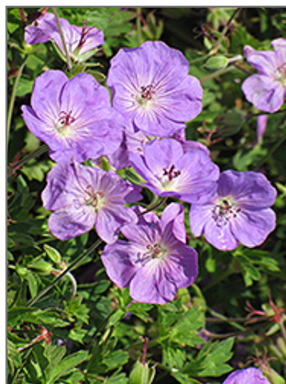
Rozanne Cranesbill flowers