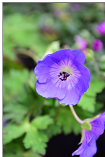
Rozanne Cranesbill flowers

This is a relatively low maintenance plant, and should only be pruned after flowering to avoid removing any of the current season's flowers. It is a good choice for attracting butterflies to your yard, but is not particularly attractive to deer who tend to leave it alone in favor of tastier treats. It has no significant negative characteristics.