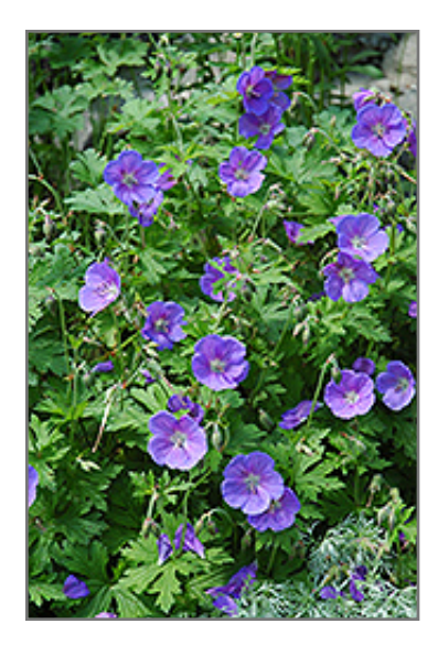
Johnson's Blue Cranesbill flowers

This is a relatively low maintenance plant, and should only be pruned after flowering to avoid removing any of the current season's flowers. Deer don't particularly care for this plant and will usually leave it alone in favor of tastier treats. It has no significant negative characteristics.