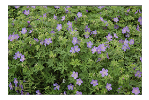
Johnson's Blue Cranesbill in bloom

Johnson's Blue Cranesbill is recommended for the following landscape applications;