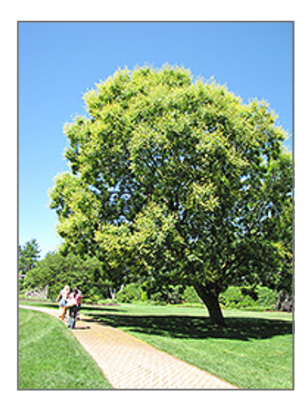
Golden Rain Tree in bloom

Golden Rain Tree is recommended for the following landscape applications;