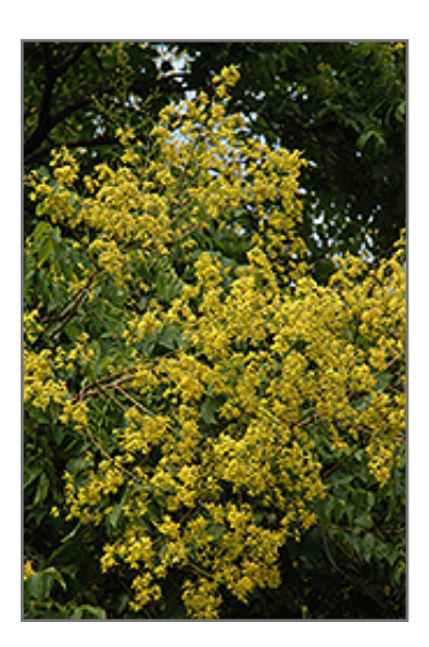
Golden Rain Tree flowers