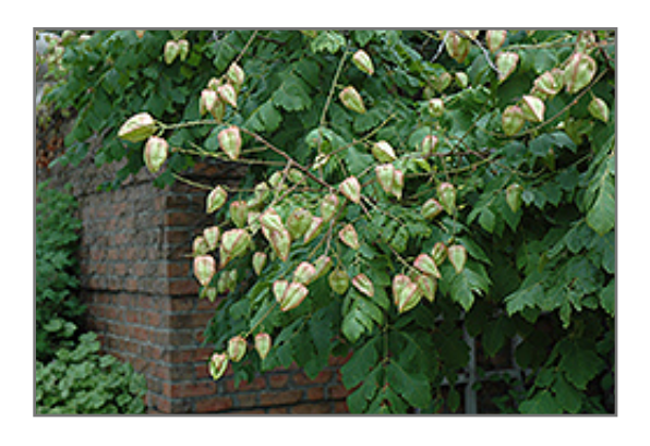
Golden Rain Tree fruit

This tree should only be grown in full sunlight. It is very adaptable to both dry and moist locations, and should do just fine under average home landscape conditions. It is considered to be drought-tolerant, and thus makes an ideal choice for xeriscaping or the moisture-conserving landscape. It is not particular as to soil type or pH, and is able to handle environmental salt. It is highly tolerant of urban pollution and will even thrive in inner city environments. This species is not originally from North America, and parts of it are known to be toxic to humans and animals, so care should be exercised in planting it around children and pets.