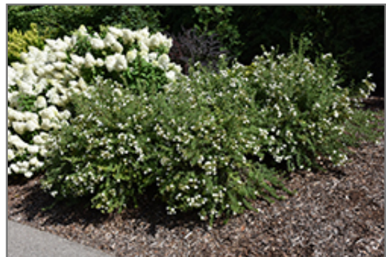
Happy Face White Potentilla in bloom