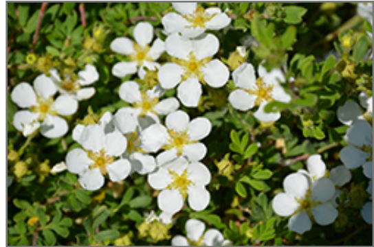
Happy Face White Potentilla flowers