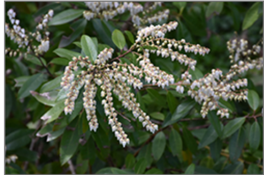
Mountain Pieris flowers

This shrub will require occasional maintenance and upkeep, and should only be pruned after flowering to avoid removing any of the current season's flowers. Deer don't particularly care for this plant and will usually leave it alone in favor of tastier treats. It has no significant negative characteristics.