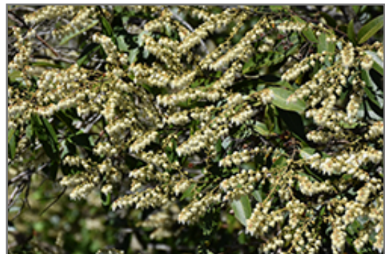
Mountain Pieris flowers