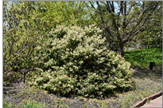
Mountain Pieris in bloom

This shrub does best in full sun to partial shade. It requires an evenly moist well-drained soil for optimal growth, but will die in standing water. It is very fussy about its soil conditions and must have rich, acidic soils to ensure success, and is subject to chlorosis (yellowing) of the foliage in alkaline soils. It is somewhat tolerant of urban pollution, and will benefit from being planted in a relatively sheltered location. Consider applying a thick mulch around the root zone in winter to protect it in exposed locations or colder microclimates. This species is native to parts of North America, and parts of it are known to be toxic to humans and animals, so care should be exercised in planting it around children and pets.