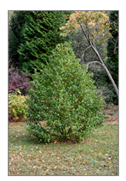
Yule Bright Holly fruit

Yule Bright Holly is recommended for the following landscape applications;