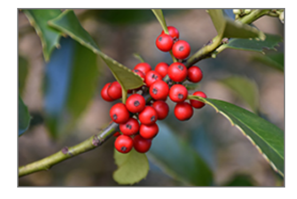
Yule Bright Holly fruit

Lustrous dark green, evergreen foliage with spiny edges, and a narrow pyramidal habit; brilliant scarlet fruit adds color to the fall and winter landscape; does best in evenly moist, acidic soil, an excellent screening plant