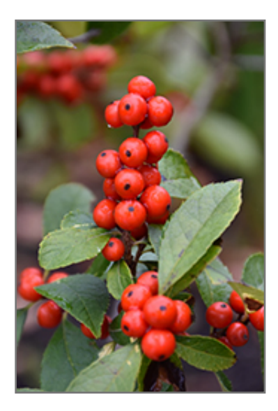
Sunsplash Winterberry fruit