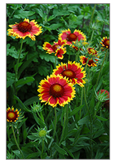
Goblin Blanket Flower flowers

Tomato-red daisy like flowers with golden yellow edges stand above mounds of gray-green foliage on these compact plants; excellent for borders, beds, containers and cutting gardens; drought and heat tolerant requiring little maintenance