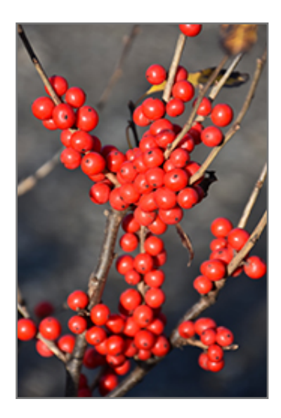
Berry Poppins Winterberry fruit