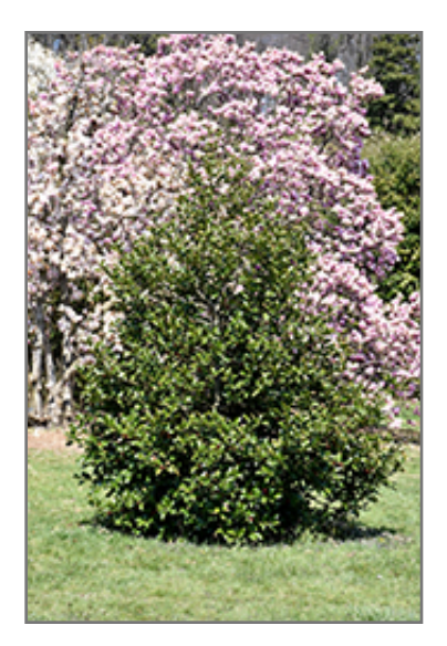
Hohman Koehne Holly

Hohman Koehne Holly is primarily grown for its highly ornamental fruit. It features an abundance of magnificent red berries from mid fall to mid winter. It has attractive dark green evergreen foliage. The large glossy oval leaves are highly ornamental and remain dark green throughout the winter.