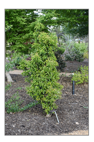
Shii-Mochi Japanese Holly