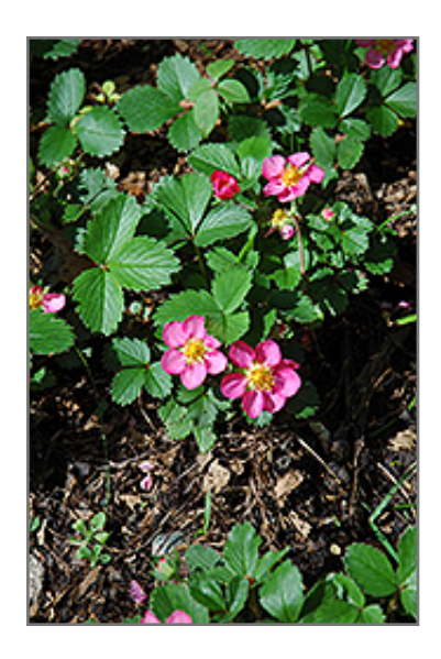
Pink Panda Strawberry flowers