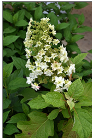
Gatsby Star Hydrangea flowers