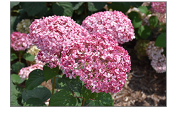
Invincibelle Spirit II Hydrangea flowers

Invincibelle Spirit II Hydrangea is a multi-stemmed deciduous shrub with a more or less rounded form. Its strikingly bold and coarse texture can be very effective in a balanced landscape composition.