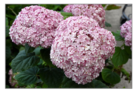
Invincibelle Spirit II Hydrangea flowers

This shrub will require occasional maintenance and upkeep, and is best pruned in late winter once the threat of extreme cold has passed. It has no significant negative characteristics.