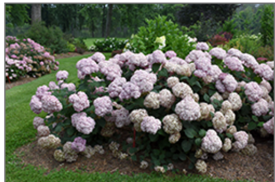
Incrediball Blush Smooth Hydrangea in bloom