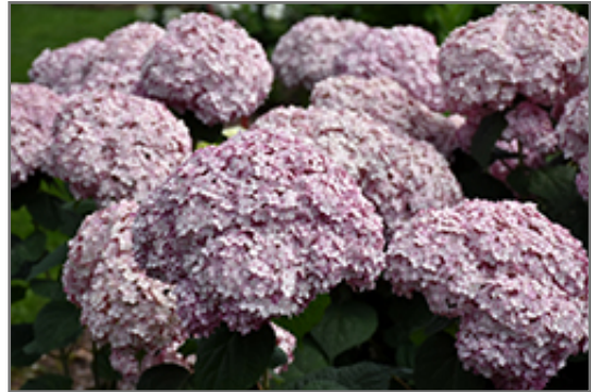
Incrediball Blush Smooth Hydrangea flowers (faded)

This shrub does best in full sun to partial shade. You may want to keep it away from hot, dry locations that receive direct afternoon sun or which get reflected sunlight, such as against the south side of a white wall. It prefers to grow in average to moist conditions, and shouldn't be allowed to dry out. It is not particular as to soil type or pH. It is highly tolerant of urban pollution and will even thrive in inner city environments. Consider applying a thick mulch around the root zone in winter to protect it in exposed locations or colder microclimates. This is a selection of a native North American species.