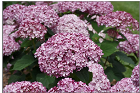
Incrediball Blush Smooth Hydrangea