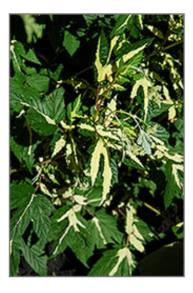
Variegated Queen Of The Meadow foliage

This plant does best in partial shade to shade. It is quite adaptable, prefering to grow in average to wet conditions, and will even tolerate some standing water. It is not particular as to soil pH, but grows best in rich soils. It is somewhat tolerant of urban pollution. Consider applying a thick mulch around the root zone over the growing season to conserve soil moisture. This is a selected variety of a species not originally from North America. It can be propagated by division; however, as a cultivated variety, be aware that it may be subject to certain restrictions or prohibitions on propagation.