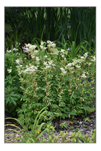
Variegated Queen Of The Meadow in bloom