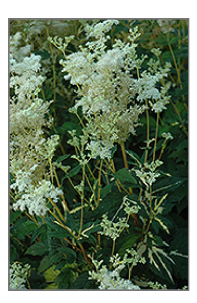
Variegated Queen Of The Meadow flowers