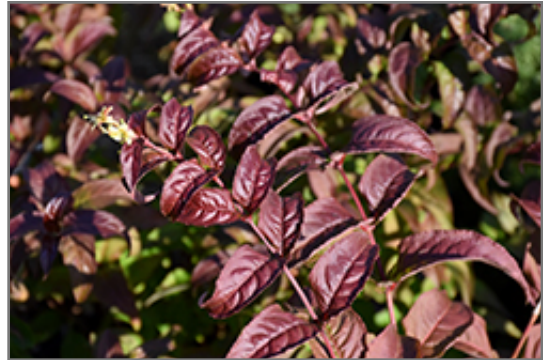
Kodiak Black Diervilla foliage

Kodiak Black Diervilla will grow to be about 4 feet tall at maturity, with a spread of 4 feet. It tends to fill out right to the ground and therefore doesn't necessarily require facer plants in front. It grows at a medium rate, and under ideal conditions can be expected to live for approximately 20 years.