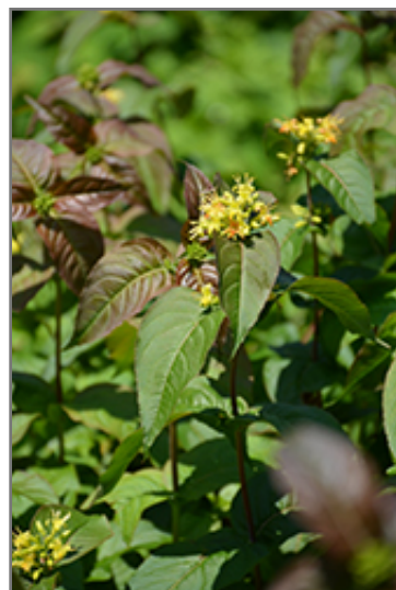
Kodiak Black Diervilla flowers