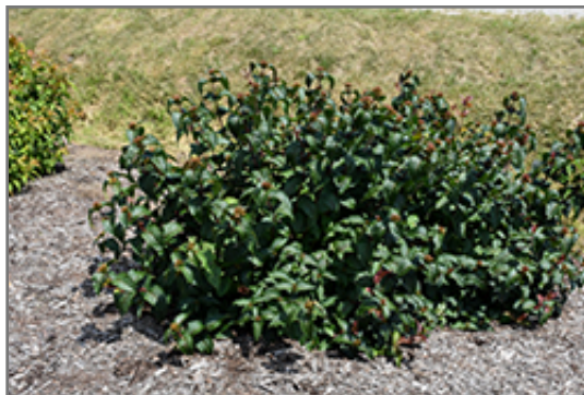
Kodiak Black Diervilla