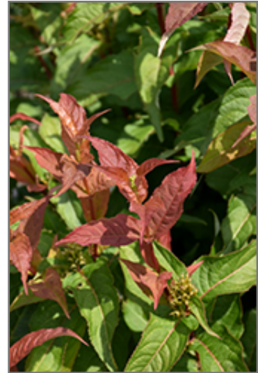
Kodiak Orange Diervilla foliage

Kodiak Orange Diervilla is recommended for the following landscape applications;