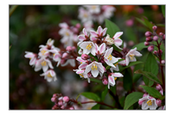
Nikko Blush Deutzia flowers

Nikko Blush Deutzia will grow to be about 4 feet tall at maturity, with a spread of 5 feet. It tends to be a little leggy, with a typical clearance of 1 foot from the ground. It grows at a slow rate, and under ideal conditions can be expected to live for approximately 20 years.