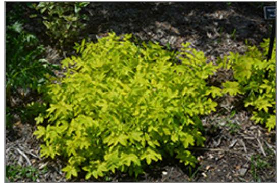
Golden Queen Of The Meadow

Golden Queen Of The Meadow is recommended for the following landscape applications;