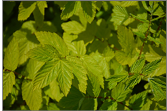
Golden Queen Of The Meadow foliage

Golden Queen Of The Meadow will grow to be about 32 inches tall at maturity, with a spread of 24 inches. It tends to be leggy, with a typical clearance of 1 foot from the ground, and should be underplanted with lower-growing perennials. It grows at a medium rate, and under ideal conditions can be expected to live for approximately 10 years. As an herbaceous perennial, this plant will usually die back to the crown each winter, and will regrow from the base each spring. Be careful not to disturb the crown in late winter when it may not be readily seen!