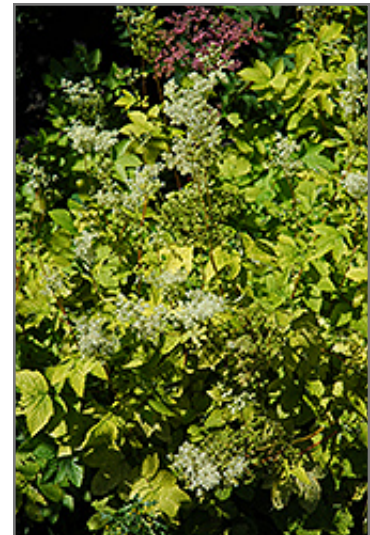
Golden Queen Of The Meadow flowers