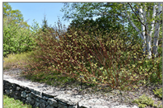
Bailey's Red Twig Dogwood in spring