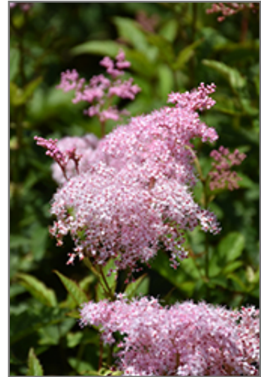
Queen Of The Prairie flowers