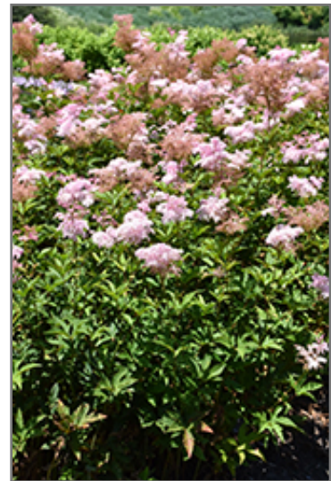
Queen Of The Prairie in bloom