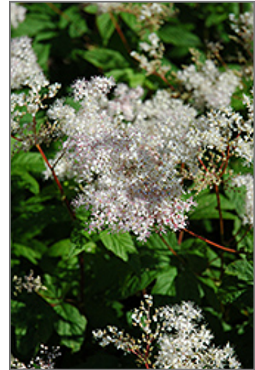
Elegans Siberian Meadowsweet flowers

Elegans Siberian Meadowsweet is recommended for the following landscape applications;