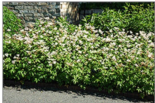
Elegans Siberian Meadowsweet in bloom