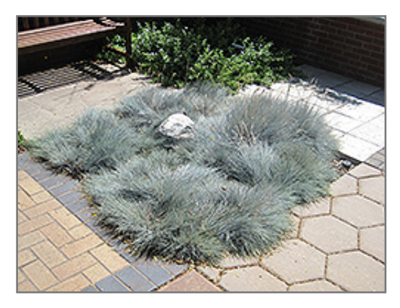
Blue Fescue