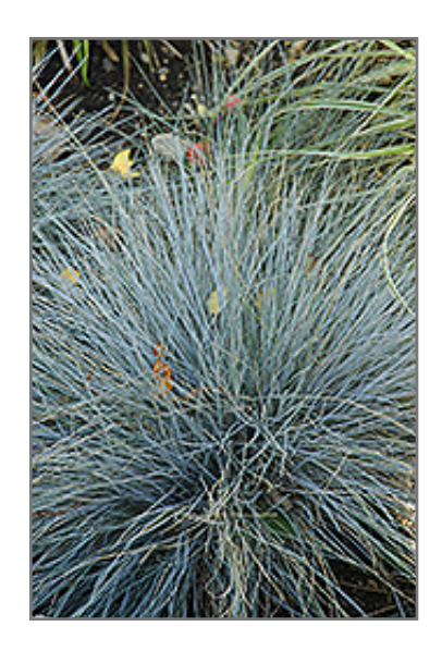
Blue Fescue

Blue Fescue is recommended for the following landscape applications;