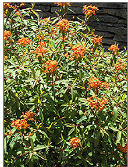
Fireglow Spurge in bloom