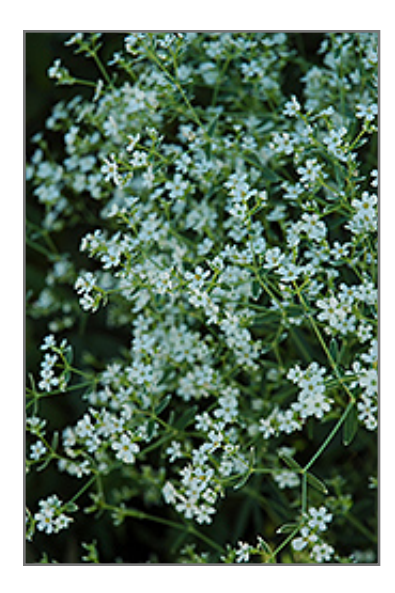
Flowering Spurge flowers