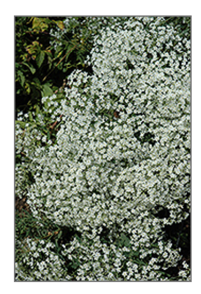
Flowering Spurge flowers