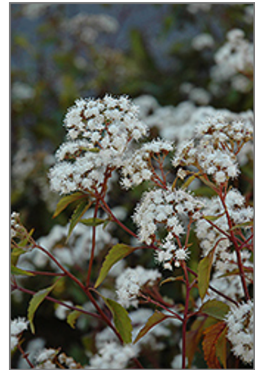
Chocolate Boneset flowers

Chocolate Boneset is recommended for the following landscape applications;