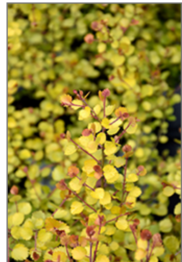
Cesky Gold Dwarf Birch foliage