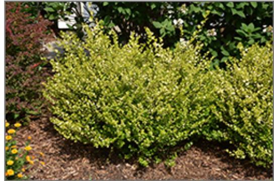
Cesky Gold Dwarf Birch