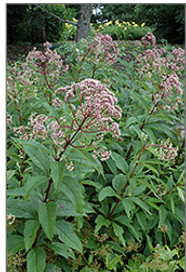
Gateway Joe Pye Weed flowers