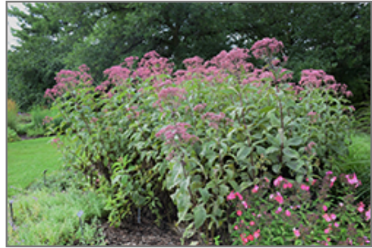
Gateway Joe Pye Weed in bloom