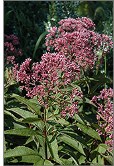
Gateway Joe Pye Weed flower buds

Gateway Joe Pye Weed is an herbaceous perennial with an upright spreading habit of growth. Its wonderfully bold, coarse texture can be very effective in a balanced garden composition.