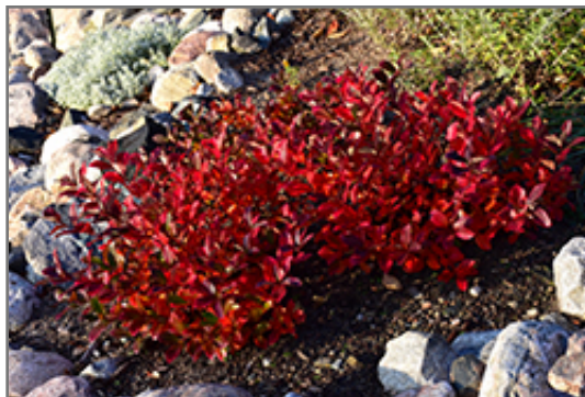
Low Scape Mound Aronia in fall

Low Scape Mound Aronia makes a fine choice for the outdoor landscape, but it is also well-suited for use in outdoor pots and containers. It can be used either as 'filler' or as a 'thriller' in the 'spiller-thriller-filler' container combination, depending on the height and form of the other plants used in the container planting. It is even sizeable enough that it can be grown alone in a suitable container. Note that when grown in a container, it may not perform exactly as indicated on the tag - this is to be expected. Also note that when growing plants in outdoor containers and baskets, they may require more frequent waterings than they would in the yard or garden. Be aware that in our climate, most plants cannot be expected to survive the winter if left in containers outdoors, and this plant is no exception. Contact our experts for more information on how to protect it over the winter months.