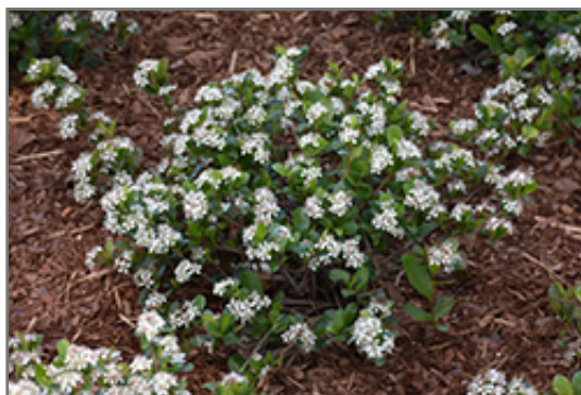
Low Scape Mound Aronia in bloom

This shrub will require occasional maintenance and upkeep, and is best pruned in late winter once the threat of extreme cold has passed. Gardeners should be aware of the following characteristic(s) that may warrant special consideration;