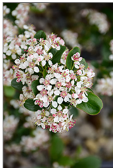
Low Scape Mound Aronia flowers