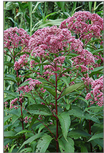
Joe Pye Weed flowers

Joe Pye Weed is recommended for the following landscape applications;