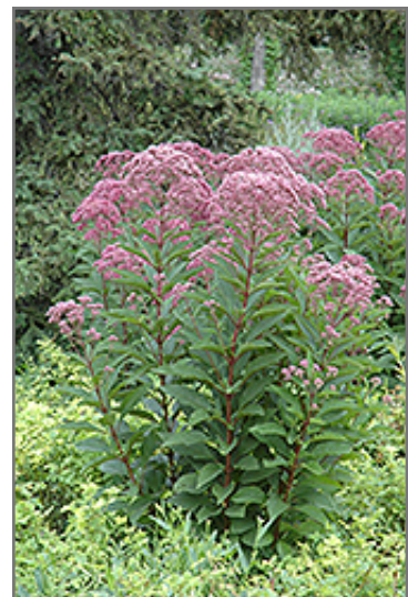
Joe Pye Weed in bloom