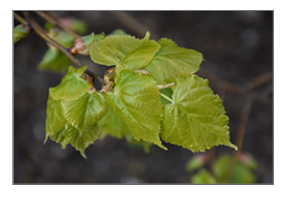
Akira Gold Linden foliage