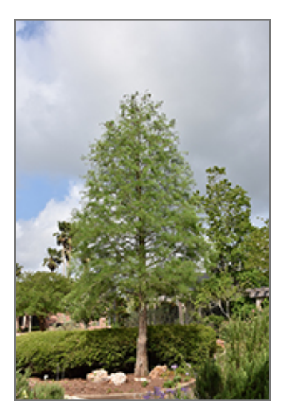
Pond Cypress

Pond Cypress is recommended for the following landscape applications;