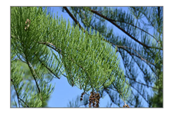
Pond Cypress foliage