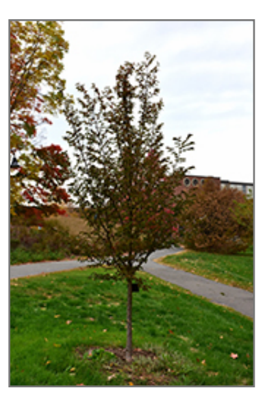
Skyrocket Hybrid Stewartia in fall

Skyrocket Hybrid Stewartia features delicate creamy white flowers with gold anthers along the branches in early summer. It has forest green deciduous foliage. The pointy leaves turn an outstanding red in the fall. The mottled khaki (brownish-green) bark is extremely showy and adds significant winter interest.