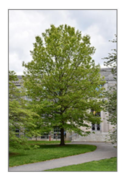
High Point Nuttall Oak