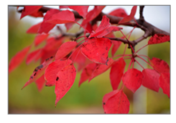
New Bradford Ornamental Pear in fall

This tree should only be grown in full sunlight. It prefers to grow in average to moist conditions, and shouldn't be allowed to dry out. It is not particular as to soil type or pH. It is highly tolerant of urban pollution and will even thrive in inner city environments. This is a selected variety of a species not originally from North America.