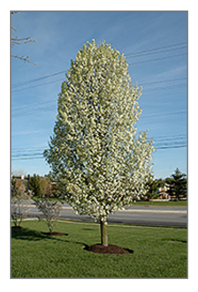
New Bradford Ornamental Pear in bloom

This is a high maintenance tree that will require regular care and upkeep, and is best pruned in late winter once the threat of extreme cold has passed. Gardeners should be aware of the following characteristic(s) that may warrant special consideration;