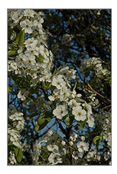
New Bradford Ornamental Pear flowers