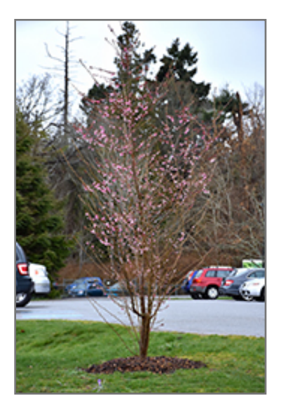
Whitcomb Higan Cherry in bloom