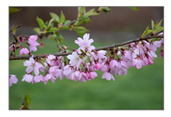
Whitcomb Higan Cherry flowers

Whitcomb Higan Cherry is recommended for the following landscape applications;